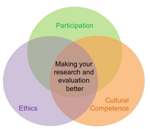
Figure 1 Participation, Ethics & Cultural competence combine to make your evaluation research better

Paying attention to each of these aspects will in turn benefit the others. See Annex 1 for further detail.